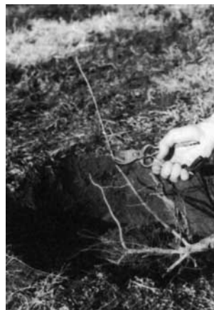
Figure 3. Trim broken and crossed roots and shorten all roots to about 18 inches.