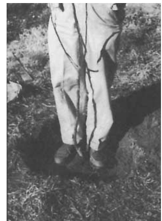
Figure 4. Tamp the soil with your foot as the hole is filled.

removed from the hole. Refilling the hole with other materials will create an undesirable situation. To avoid air pockets, tamp the soil with your foot as the hole is filled (Figure 4). After the soil has been firmly tamped, slowly apply 1 or 2 gallons of water to the tree. This will hydrate the tree and help settle the soil around the roots. Add additional soil if needed to maintain the soil at the same level as that surrounding the hole (unless planting on a berm). If the graft union of the tree sinks into the soil, reposition it so it remains 2 inches above the soil level. When the graft union becomes covered with soil, the scion cultivar will root and the dwarfing habit induced by the rootstock will be lost.