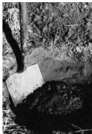
Figure 1. Dig hole 2 feet wider than the spread of the roots.

Before planting the tree, inspect the root system. Prune broken roots and shorten long roots to 12 to 18 inches (Figure 3). Use sharp pruning shears. Place the tree in the hole and arrange the roots so they aren't overlapping. If they appear cramped, make the hole larger! Refill the hole with the same soil that was