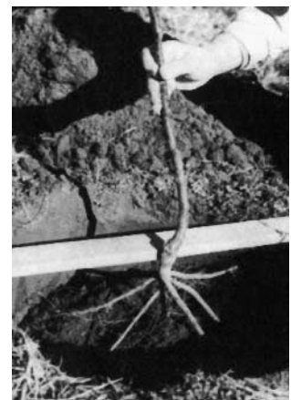
Figure 2. Plant tree at the same depth it was planted in the nursery.